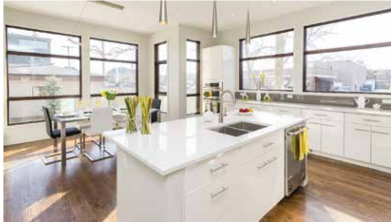
Awesome Outdoor Project